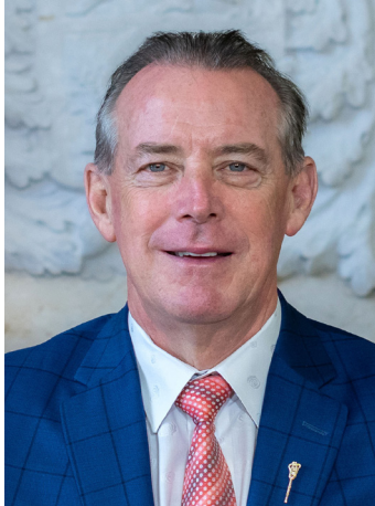
The Honourable Don McMorris, Minister of Labour Relations and Workplace Safety

Office of the Lieutenant Governor of Saskatchewan